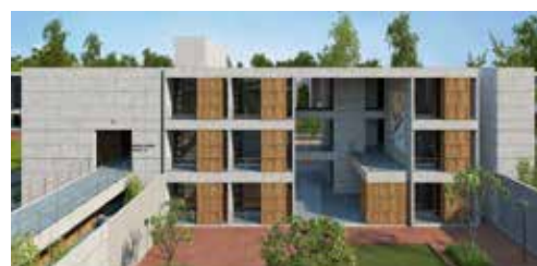
Presentation by the State