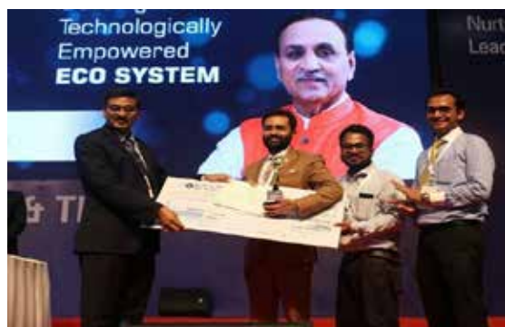
Presentation by the State