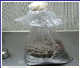
Fig. 3. Inoculated bag