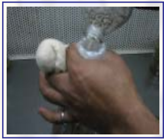
Fig. 2. Inoculation of sterilized bags