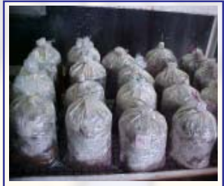
Fig. 4. Spawn run bags