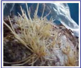
Fig. 6. Initiation of primordia