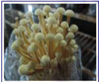
Fig. 8. Crop ready to harvest