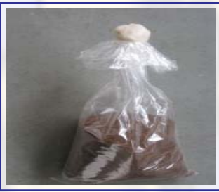
Fig. 1. Filled bags