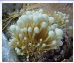
Fig. 7. Developing primordia