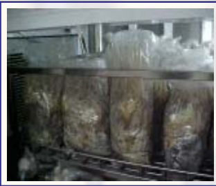
Fig. 5. Bags ready for fruiting