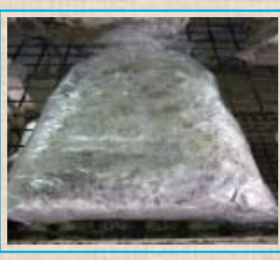
Fig. 5. Mycelial coat formation stage