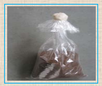
Fig. 1. Filled bags