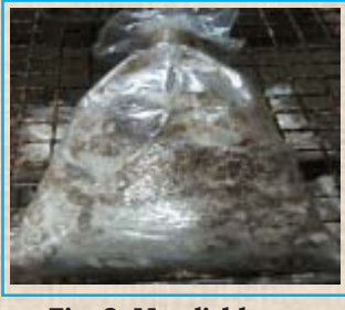
Fig. 6. Mycelial bump formation stage