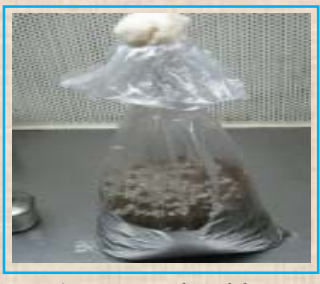
Fig. 3. Inoculated bag