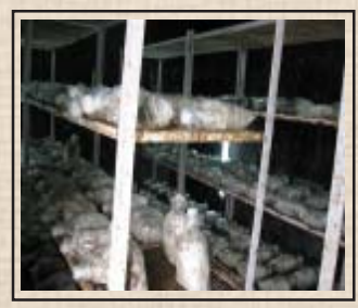
Fig. 4. Spawn run bags