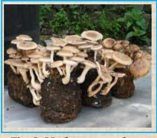
Fig. 8. Mushrooms ready to harvest